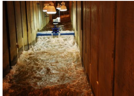
Fig.3 EnviroGen turbine installed and operating in the test flume where fish were released and monitored.

New Energy has extensively monitored its turbines for impact on aquatic life. An independent study initiated by the Electric Power Research Institute (EPRI) and supported by Natural Resources Canada was conducted by the S.O.Conte Anadromous Fish Research Center located in Turner Falls, MA, on juvenile Atlantic Salmon and adult American Shad to determine the impact of a 5kW New Energy turbine on fish having to traverse a restricted channel. The fish were instrumented with transmitters, released into the channel, and behavior monitored. Even though this was an extreme situation with the fish having to pass very close or through the turbine, no mortality or injuries were observed.