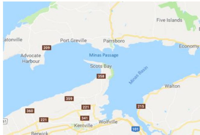
Fig.1 Map of Bay of Fundy showing Minas Passage

NewEast Energy Corporation, a wholly owned subsidiary of New Energy Corporation Inc., has applied to the Nova Scotia Department of Energy for a permit to deploy up to 800kW of tidal power generation equipment in the Minas Passage at a location next to the existing Fundy Ocean Research Center for Energy (FORCE) Crown Lease Area. The installation will consist of an array of floating grid connected New Energy EnviroGen™ Power Generation systems based on the Darrieus vertical axis cross flow turbine. Energy produced with these turbines will be conditioned and supplied to the Nova Scotia Power grid system through the existing FORCE substation located near the tidal generation site. 1