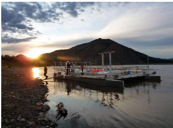
Fig. 4 Preparing for installation of a 25kW low flow unit on the Yukon River, Alaska

To minimize risk and complete the project with the highest level of certainty, the project will be executed following a staged approach that includes an initial pilot installation using New Energy’s existing and proven 25kW (rerated to 50kW) power generation hardware. This initial pilot phase involves the installation of two 25/50kW EnviroGen Power Generation systems, that once proven, will set the stage for the scale up and full build out phases, consisting of the installation of three 250kW units, by proving out all steps required to assemble, deploy, interconnect, and operate the power plant without incurring the potential high costs of having to rework the processes and procedures with the larger systems.