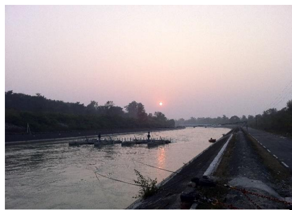
Fig. 5 Two 25kW units operating on the Chilla Canal in Northern India